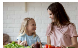
Get Kids Interested in Nutrition 6 mins