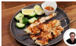
Chicken Satay 8 mins