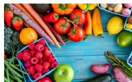
Nourish Your Everyday