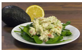
Cooking to Reduce Stress 7 mins