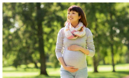
Pre-Natal Nutrition 3rd Trimester 10 mins