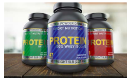
The Ins & Outs of Protein 5 mins