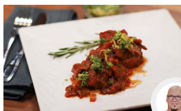
Meatless Meals 11 mins