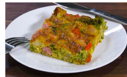
What to Eat After a Workout 7 mins